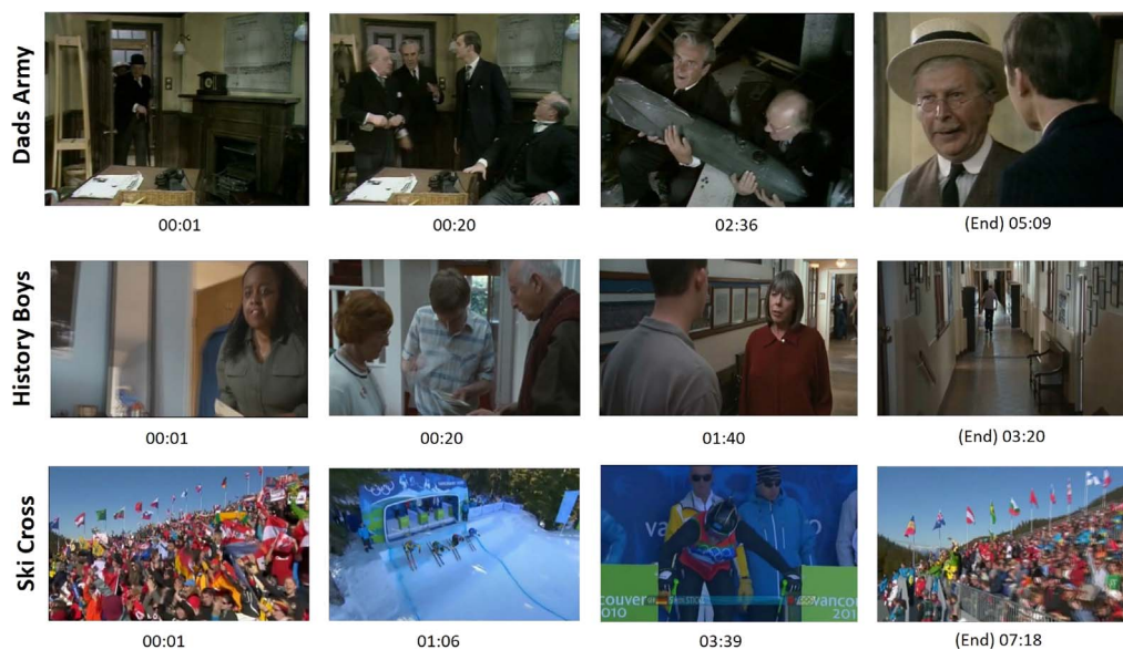
Fig. 2. Sample frames excerpted at a specific time from the three video clip used in the experiment.

Participants viewed sequentially three unmodified TV and film clips (including audio) on a 22 in. monitor (Iiyama Vision Master PRO 514, Iiyama Corporation, Tokyo, Japan) at a resolution of 1600 by 1200 pixels (refresh rate 100 Hz). Monocular eye movements were recorded using an EyeLink 1000 eye tracker (SR Research, Ontario, Canada), while participants watched the video clips monocularly. The eye tracker was configured to detect saccades using velocity and acceleration thresholds of 30^\circ/s and 8000^\circ/s^2 , respectively. The eye giving the best quality pupil detection and corneal reflection was chosen for tracking. The EyeLink proprietary algorithm (nine point calibration) was used to calibrate the eye tracker and was repeated, as required, until the accuracy was judged by the software to be of a “good” quality. Drift correction was also performed prior to each of the three video clips. In cases where a large drift ( > 5^\circ ) was detected, a recalibration was performed.